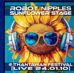
Exotic Indie Tech