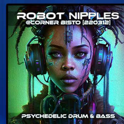
Psy Drum & Bass